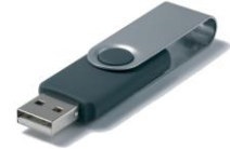
Crew USB drive