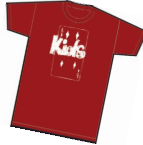
Crew Year T-shirt